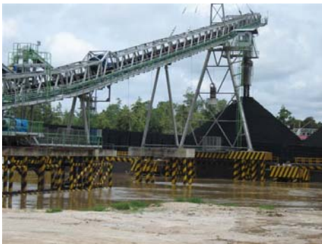
Figure 1: A Barge loader at the Mahakam River

Sendawar is a world renowned coal province