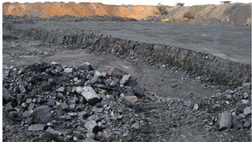
Figure 4: Typical flat coal seam in the Sendawar region.

The environmental considerations and cultural considerations of the project areas are similar to other areas of Indonesia and pose no exceptional difficulty.