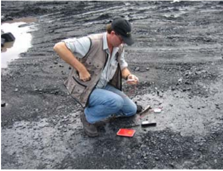
Figure 3: Churchill geologist testing a coal seam and calculating orientation.

Nearby mines are producing high quality thermal coals